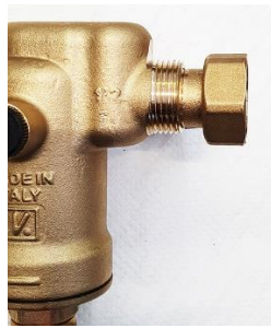
3/4" F with union fitting