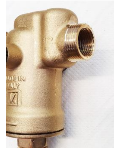
Direct 1/2" F or 3/4" M

Suggested installation in housing systems: