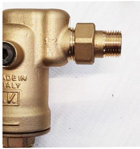
1/2" M with union fitting

Uranus Filter is easy to connect in any system with the 4 in 1 connecting system: